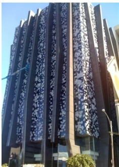
Economics & Commerce Building

GJK Facility Services is proud to be associated with the Economics & Commerce Building Development at The University of Melbourne. Recently awarded its 5 star Green Star Education Pilot rating, the building incorporates 'chilled beam' cooling technology throughout, together with natural air ventilation systems for the Ground Floor and Level 1. The building also includes environmentally-sustainable initiatives such as a double-glazed façade, enhanced features for rainwater collection, black-water recycling, recycling of cooling tower water, low-energy light fittings, low-water sanitary fittings, bike storage facilities and staff showers.